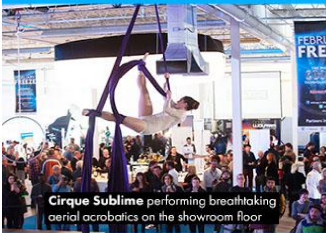
Cirque Sublime performing breathtaking aerial acrobatics on the showroom floor