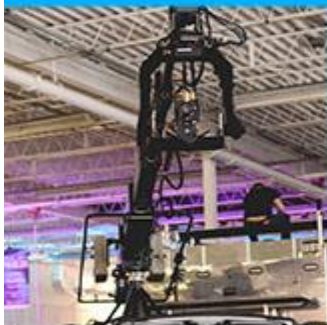
Stabilized Scorpio Remote Head attached to a 23ft Telescopic Crane