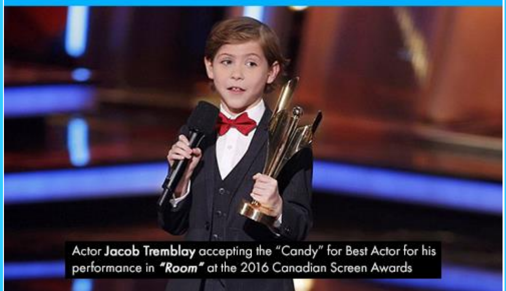
Actor Jacob Tremblay accepting the "Candy" for Best Actor for his performance in "Room" at the 2016 Canadian Screen Awards

WHITES-EQUIPPED PRODUCTIONS, "ROOM," "ORPHAN BLACK" AND "THE BOOK OF NEGROES," TAKE THE "CANDY" AT THE CANADIAN SCREEN AWARDS!