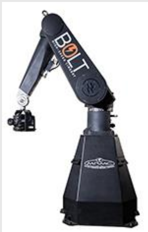
BOLT High-Speed Cinebot